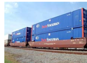
The drivers of global logistics- big ships and big trains