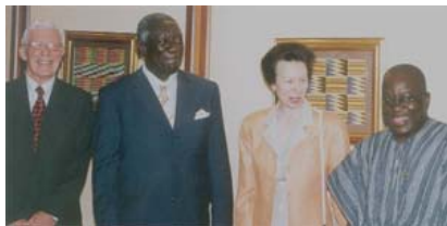
Her Royal Highness Princess Anne was the Special Guest of Honour and a Past President of the Institute.

Kufuor made these statements at an international conference of the Chartered Institute of Logistics and Transport, in Accra yesterday. The conference which is the first of its kind in Africa brought together foreign delegates from Asia, Europe, North America as well as other parts of Africa.